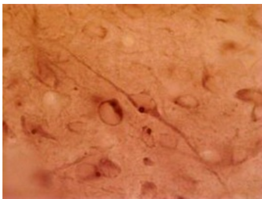
Staining of rat hypothalamus using anti-HAP1.